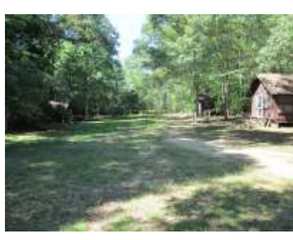
Above and left: The cabins and the "Camp Mohawk" site in Kings Landing Park.

Below: Restoration of the individual cabins is in keeping with their rustic character.