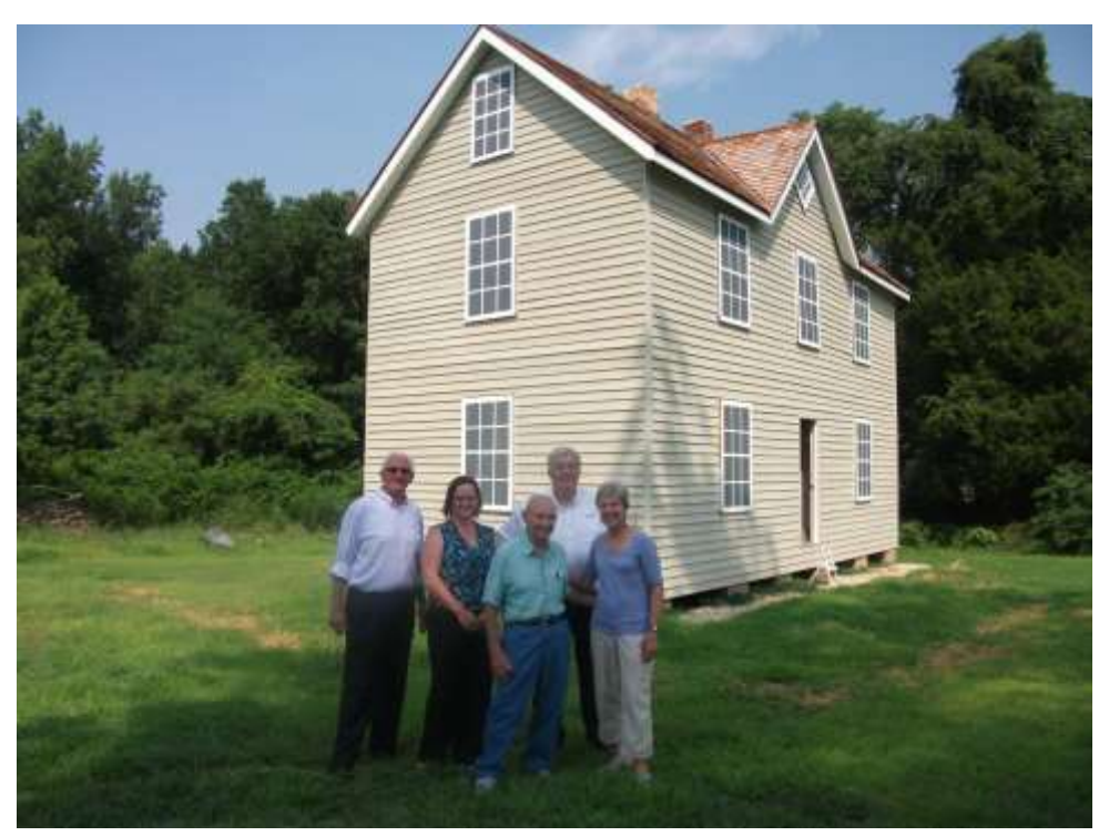
Wilson Farmstead, Galesville, Anne Arundel County