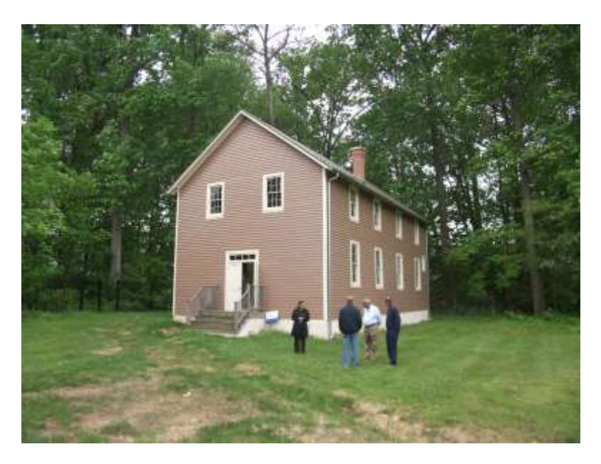
Above and right: The lodge prior to the final phase of rehabilitation.

The Odd Fellows Lodge was built during the early 1900's as a health, burial, and life insurance agency for African Americans, and it served in this capacity for over 60 years. For decades, the Lodge played a significant societal role as African Americans pushed for civil rights and equal treatment under the law. The Lodge also became the social hub for African Americans, as a popular site for picnics and dances. The current structure was built by local African American artisans. The building will be used as an educational and cultural center. The Maryland Historical Trust currently holds an easement on the property, which was stabilized in 2008 using the Trust's Capital Grant funds. The project received funds from the African American Heritage Preservation Program each year from FY2012-2015 to complete the rehabilitation, which should conclude in late 2015.