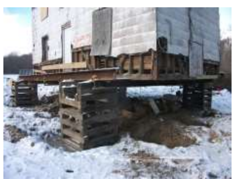
Above: Stabilization of the structure involved lifting it to repair the framing and replace the foundation.