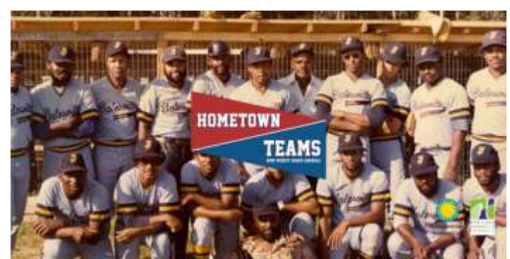
Above: "Hometown Teams", a traveling exhibit of the Smithsonian Institution, came to Galesville to celebrate the 100<sup>th</sup> anniversary of the Galesville Hot Sox (pictured).

Funds from the African American Heritage Preservation Program in FY2013 and FY2015 assisted the stabilization of the Wilson Farmstead for a future community use.