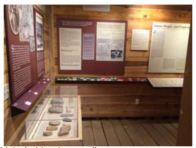
Above: The completed "Land, Lives, and Labor" exhibit in the historic corn crib.