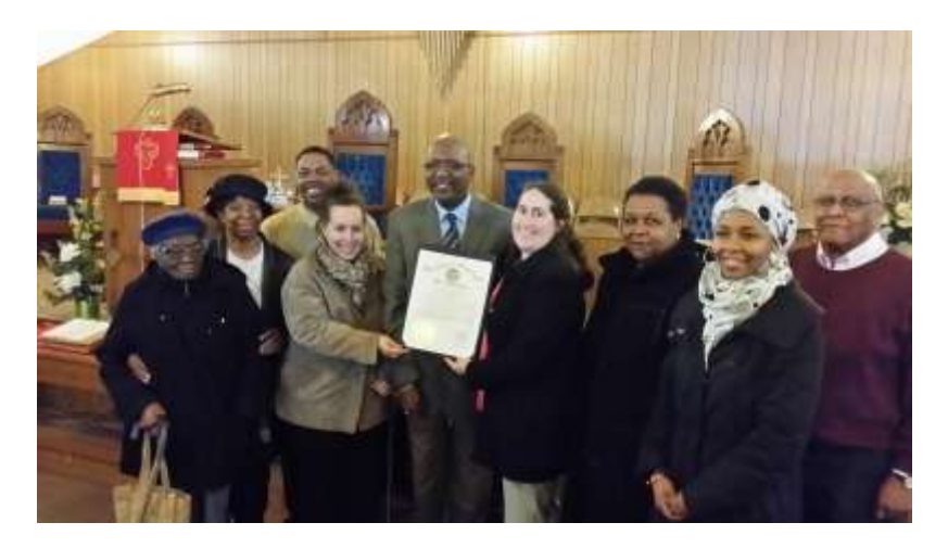
Left: Workshop attendees with representatives of MCAAHC and MHT at the workshop at Union Baptist Church in Turner Station in Baltimore County.

These workshops, which were specific to this grant program, reached and informed at least 90 interested individuals. Throughout the spring and summer, MHT and MCAAHC staff responded to specific inquiries from potential applicants and provided guidance about the application process.