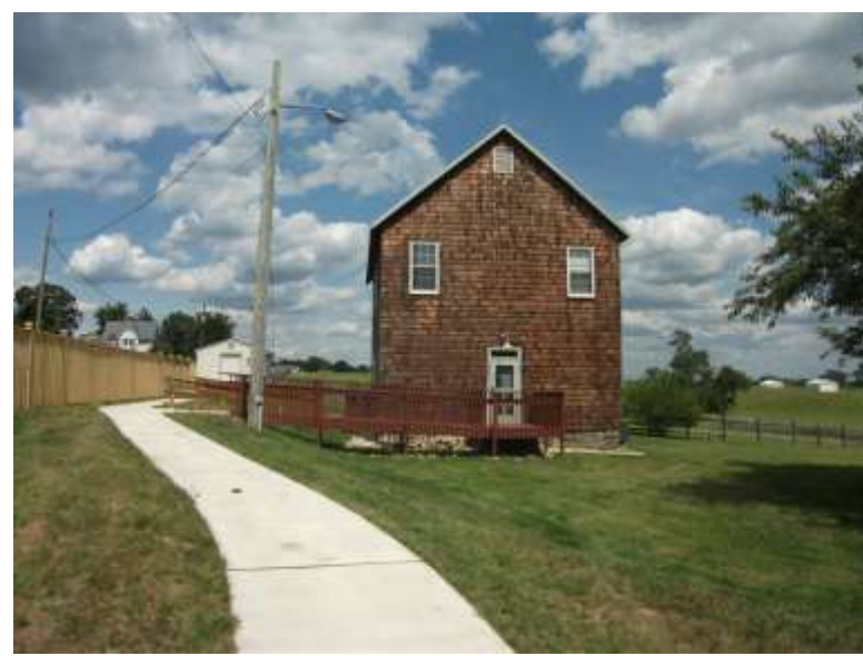
Above: The school stands in a rural crossroads community.

Constructed in 1867, Hosanna School stands as a rare, early instance of black-initiated and black-run educational efforts. The school, also known as the Berkley School after its crossroads community, is a simple rectangular building on a rubblestone foundation. This is one of four structures erected in Harford County in the years immediately following the Civil War for educating freed slaves. Of the four structures, two were built by a public source, the Freedmen's Bureau: the McComas Institute and the Green Spring School. Two, however, were built by private sources: Hosanna School and Anderson Institute in Havre de Grace. Only McComas Institute and the Hosanna School still stand. The Hosanna School was built by five black Trustees in 1868. The men erected a two-story building; the first floor was used as a school, while the second story was for the just-established Hosanna Church and also for meetings of black fraternal orders and lodges. The school was a school for African Americans until it closed in 1945. A hurricane destroyed the second story in the 20th century; MHT Capital Grant funds aided the nonprofit owners in rebuilding it in the 1990s. Currently Hosanna School serves as a oneroom school museum on first floor and meeting space and library on second floor. AAHPP funds assisted in funding a chair lift to provide physical accessibility to the upper floor.