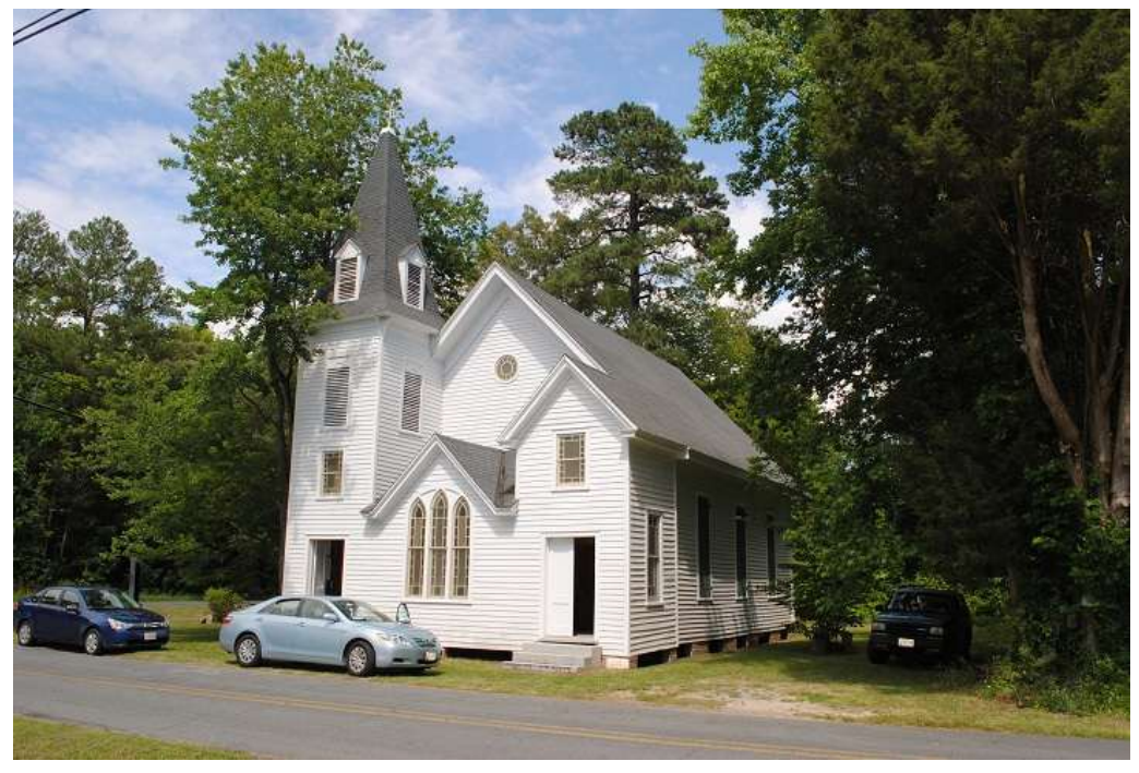
St. James M.E. Church, Oriole, Somerset County

Maryland Commission on African American History and Culture 84 Franklin Street Annapolis, MD 21401 www.africanamerican.maryland.gov