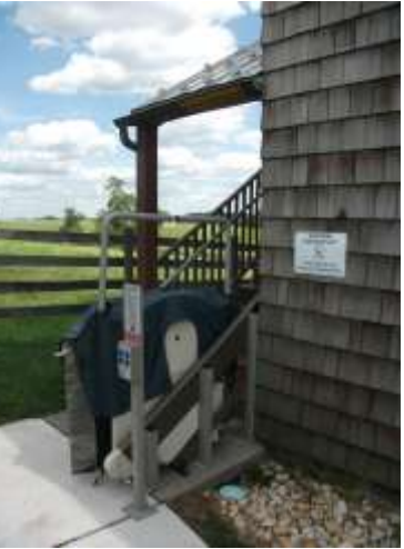
Left: Accessibility to upper floors was provided by installing a chair lift on the non-historic exterior stair at the rear of the building (near left), allowing characterdefining features of the interior to remain intact (far left).