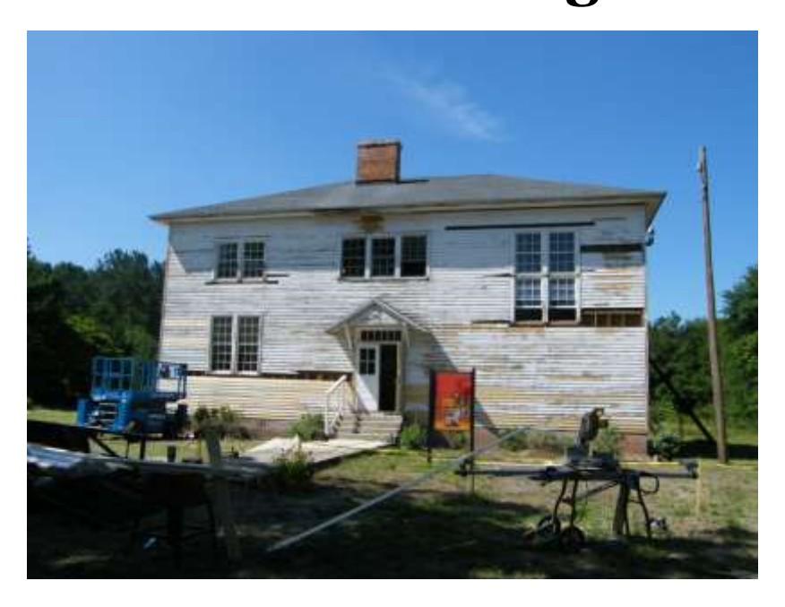
San Domingo Rosenwald School, Wicomico County