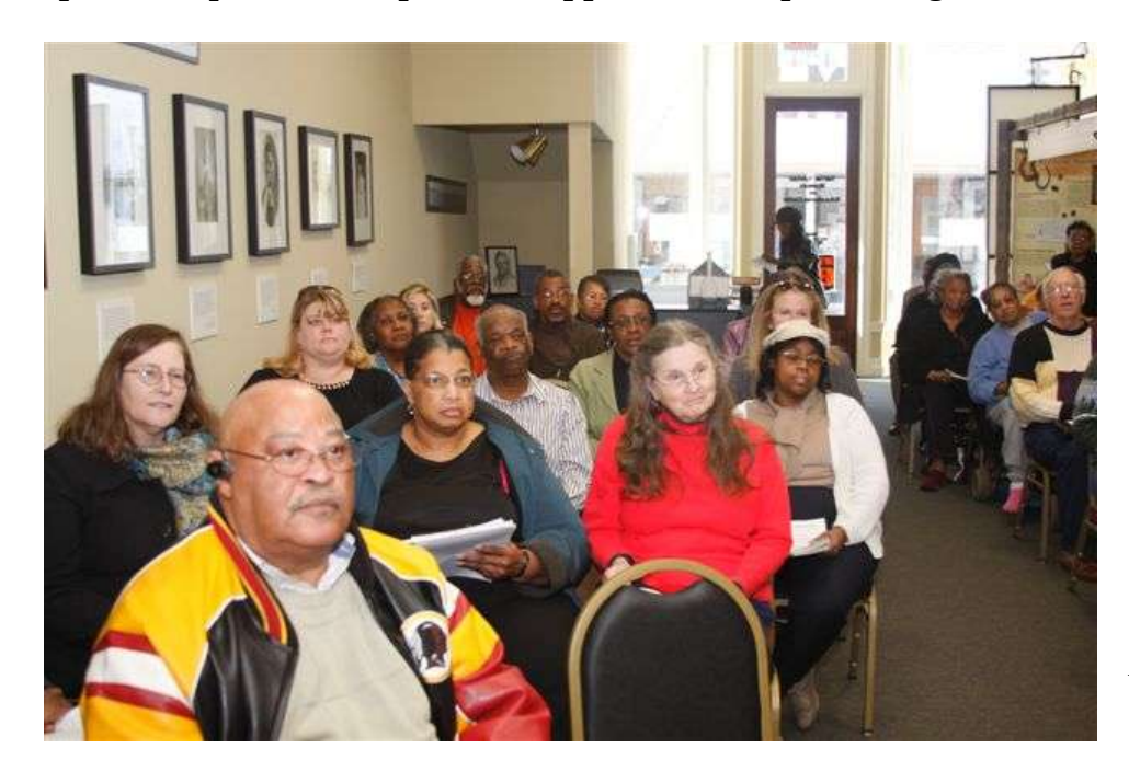
Attendees at the AAHPP grant workshop at the Harriet Tubman Museum in Cambridge, Maryland, in March 2011.

These workshops, which were specific to this grant program, reached and informed well over 100 interested individuals. Throughout the spring and summer, MHT and MCAAHC staff responded to specific inquiries from potential applicants and provided guidance about the application process.